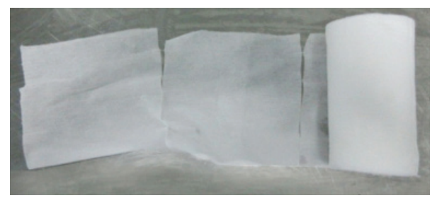
Roll contains 100 perforated polyester wipes.