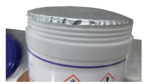
Canister is foil-sealed to keep wipes fresh.